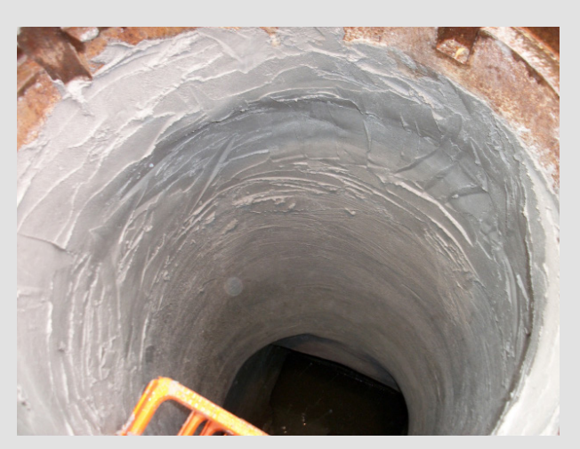
Maleki®-SWP 270 | silicate waterproofing