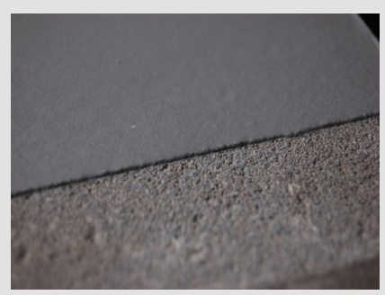
Maleki-SWP® 270 on concrete